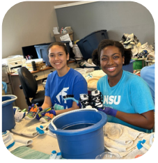
In Jacobs Shoes Cleaned shoes, the first step in making old pairs look like new