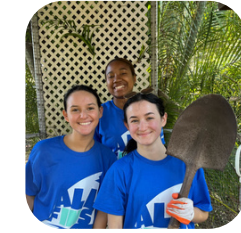
Sawgrass Nature Center Pulled invasive plants and learned about native wildlife