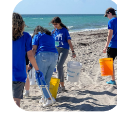
Marine Environmental Education Center (MEEC) Engaged in a beach cleanup