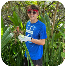
Anne Kolb Nature Center Participated in pulling invasive plants