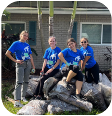
4Kids Assisted with gardening for foster families