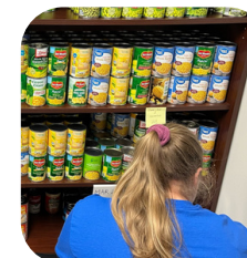
Shark Pantry Sorted and organized the pantry inventory