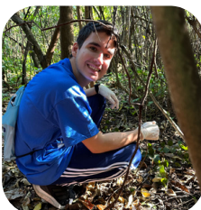
Secret Woods Nature Center Picked up trash along the river and pulled invasive plants