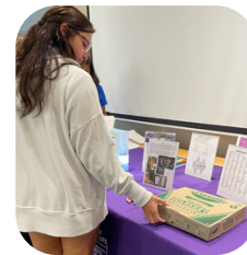
Relay For Life Wrote letters and decorated Illuminare bags