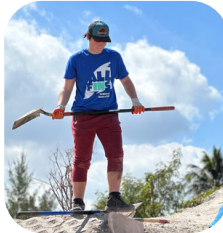
Quiet Waters Park Helped maintain bike trails and garden beds