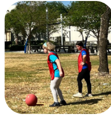
Broward Parks + Rec Special Populations Hosted a kickball game at NSU