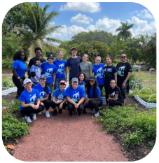
NSU Community Garden Learned about urban gardening and pulled invasive plants