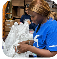
LifeNet4Families Assisted in cleaning, painting, and organizing the facility