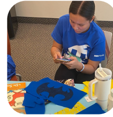
Library + HandsOn Broward Created capes for children to assist with early literacy