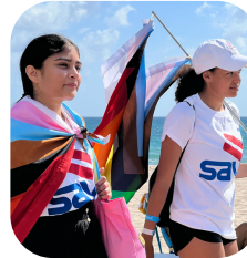
SAVE LGBTQ Walked in the AIDS Walk 5-K and build awareness about the org