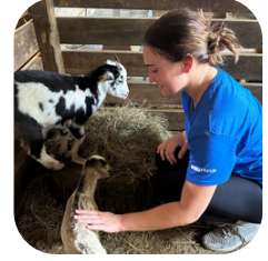
Happi Farm Helped with general tasks around the farm