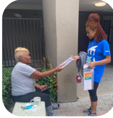
L.A. Lee YMCA Canvassed the neighborhood with YMCA resources